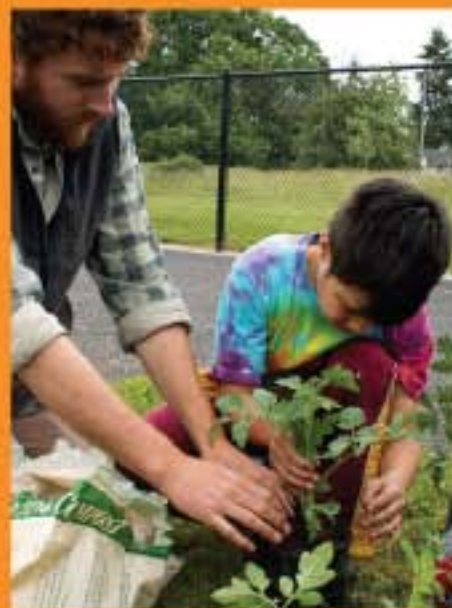
- School Garden Project Grantee